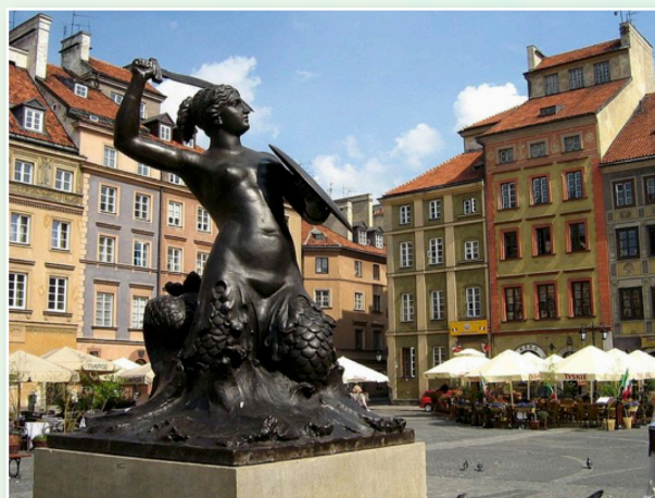
Warsaw Mermaid Statue