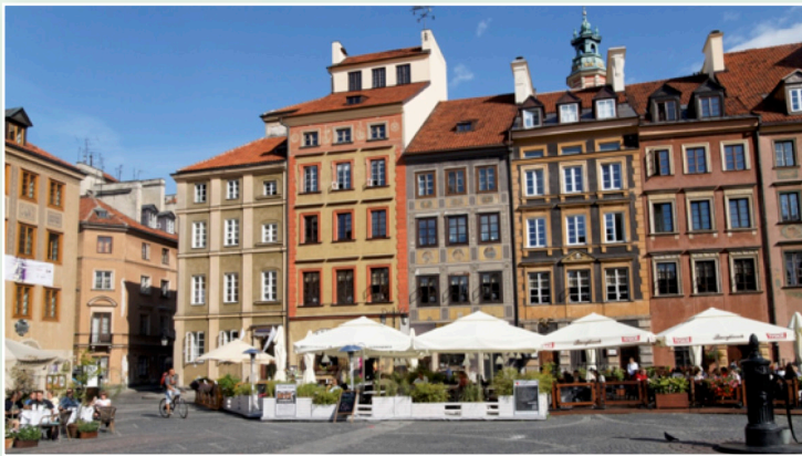
Old Town Market Square